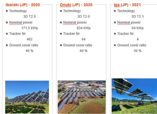
Figure 9: Agrovoltaico® plants in Japan

In 2020-21 our Japanese licensee Notus Solar has installed with REM Tec's support 1 MW of Agrovoltaico® plants using both 3D-T2.0 and 3D-T2.1 trackers (Figure 9).