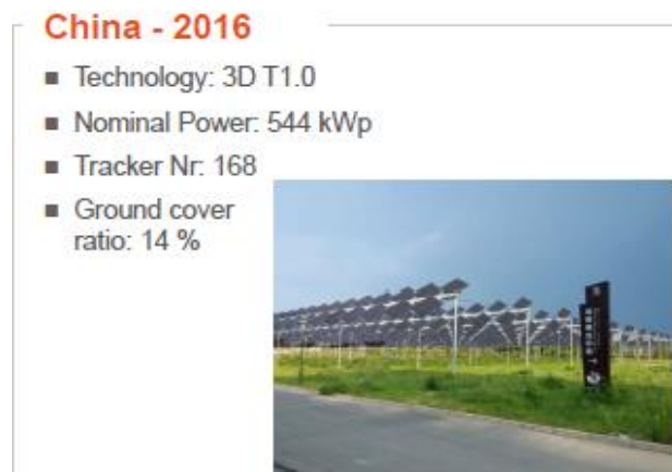
Figure 7: Agrovoltaico® plant in China (2016)

With the same technology it has been built 544 kWp in China through our licensee Sharepower in 2016 (Figure 7).