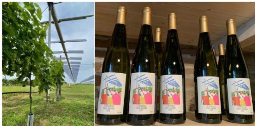
Figure 1: REM tec's vineyard and Agrovoltaico® wine

REM Tec among other experiments on numerous horticultural and fruit products, has produced the world's first Agrovoltaico® wine and this year will be the fourth consecutive year of production. (Figure 1)