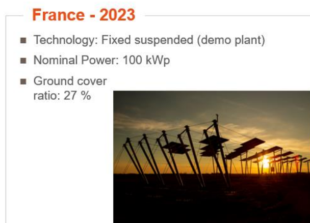
Figure 10: Agrovoltaico® plant in Beaucaire (France)

In 2023, REM Tec has installed a demo plant as partner of EDF and under support of the French ADEME in Beaucaire. This plant will use a newly developed fixed suspended technology (Figure 10).