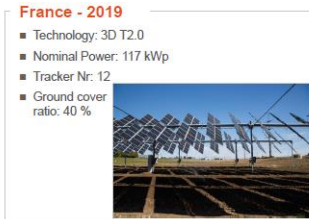
Figure 8: Agrovoltaico® plan in France (2019)

In 2020-21 our Japanese licensee Notus Solar has installed with REM Tec's support 1 MW of Agrovoltaico® plants using both 3D-T2.0 and 3D-T2.1 trackers (Figure 9).