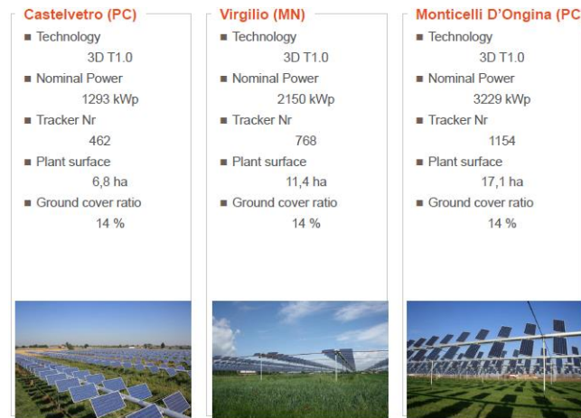
Figure 6: Agrovoltaico® plants built in 2011 in Italy

Agrovoltaico® plants are in operation in Italy, France, China, Japan, Portugal as well as Israel very soon. Further projects are currently under development in other countries. We have a track record of operation since 2011 when the first worldwide three agrivoltaic plants have been connected to grid in North Italy, for a total of 6.7 MWp with 2384 3D trackers over 35 ha (Figure 6)