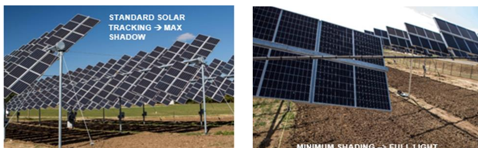
Figure 4: Management of the shadow below Agrovoltaico® tracker 3D

The tracking system guarantees a homogeneous and dynamic solar radiation for the underlying crops and it allows to manage the percentage of shading on the ground, even making it zero, if necessary, in order to optimize agricultural production (Figure 4).